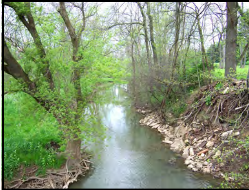
Chartiers Creek near Houston

100 West Beau Street, Suite 105 Washington, PA 15301