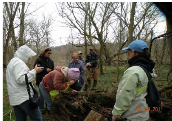
Some of the participants in the 2011 walk through the North Franklin Wetlands.