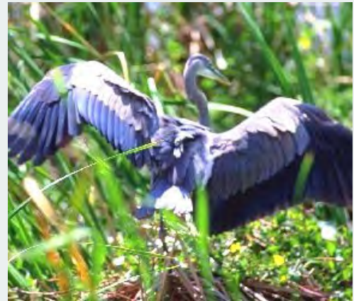
BLUE HERON, a bird often seen at Canonsburg Lake

The dataloggers were purchased with a grant from the Colcom Foundation.