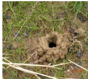
Home of a crayfish